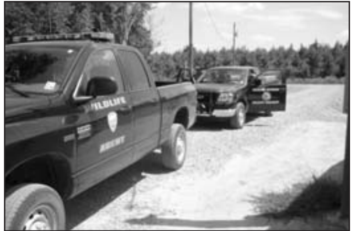
LDWF employees respond to captive deer complaint.

animal. This is brought about by a reduction in their immune system from nutritional deficiencies caused by being confined to small space. Once these animals are removed from their natural habitat they are a risk to other wild animals if they are released from captivity. The person holding the wild animal captive believes they are doing a good deed but are essentially excluding the wild animal from its natural habitat. If these animals were to be released back into their natural domain they would be a health risk to rest of the wild deer herd due to disease caused by captivity.