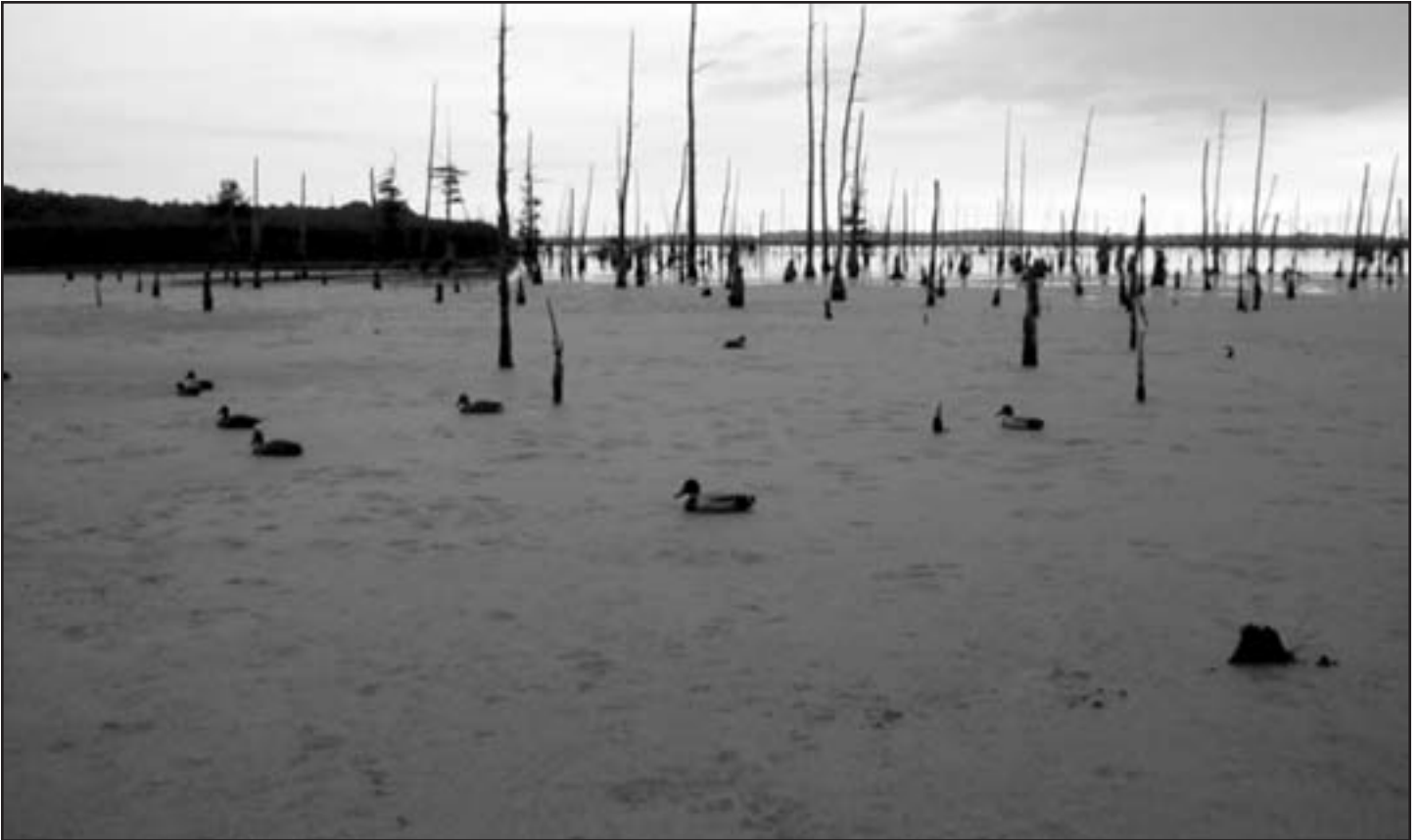
View from duck blind on Wham Brake.