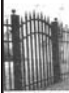
Custom Aluminum And Iron Gates