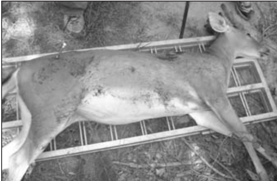
Captive 5 point buck was tranquilized for removal.

ultimate price because that deer is one less sporting opportunity for Louisiana deer hunters caused by good intentions gone wrong.