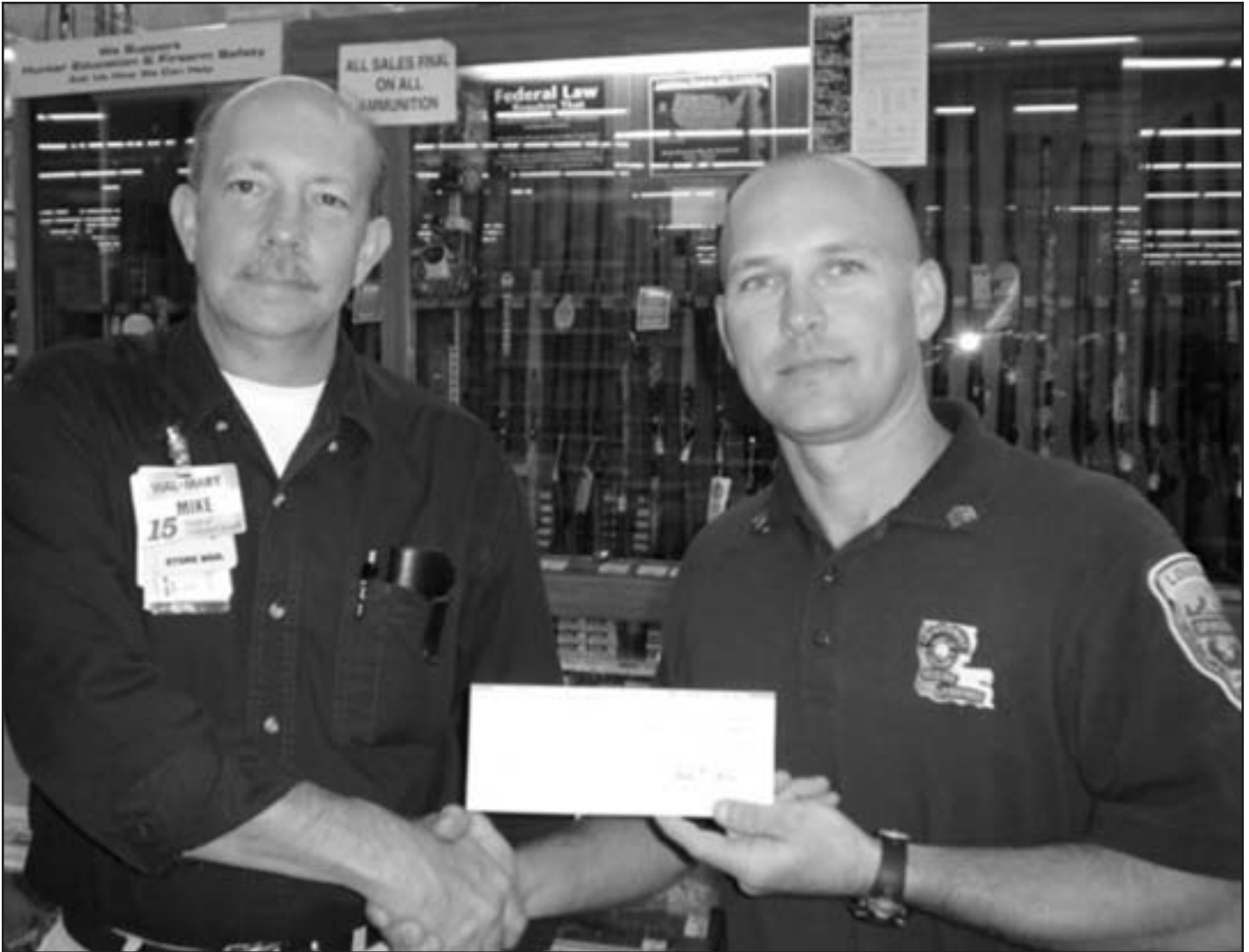
Ruston Wal-Mart donates $1,000.00 to the LWAA.