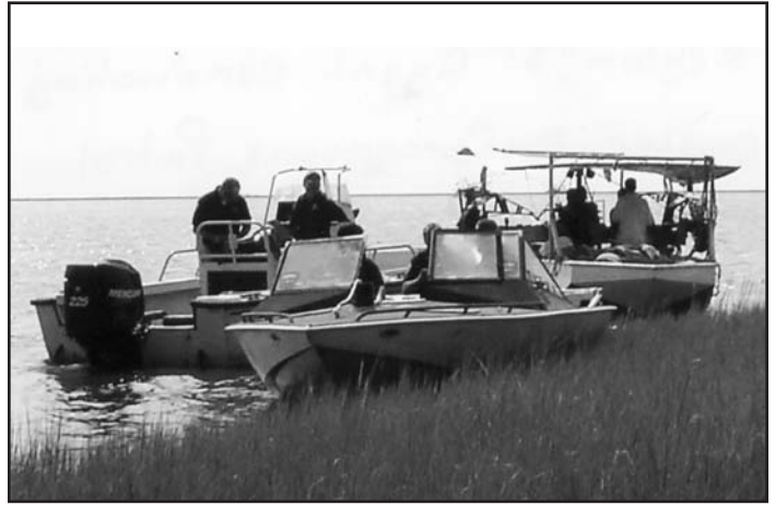
Region 8 agent conducting oyster enforcement patrol.