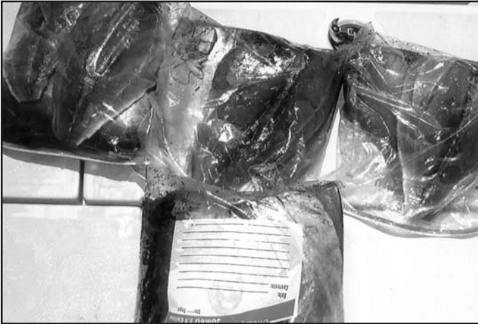
Evidence photo of filleted fish while on the water.