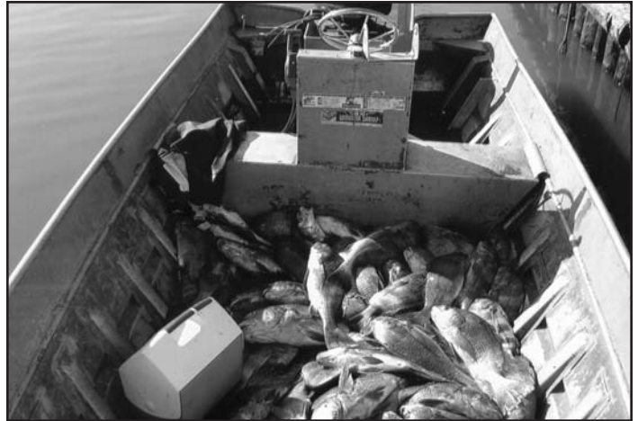
Evidence photo of gill net violations.