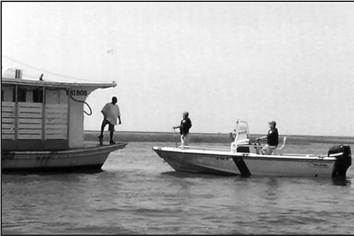
Agents conducting oyster enforcement patrol.