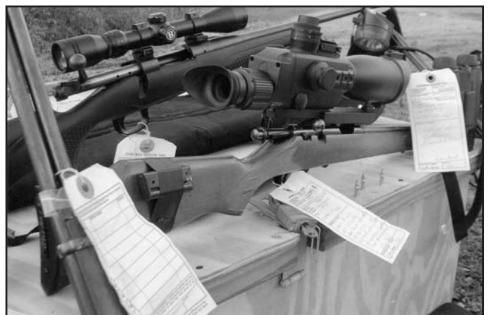
Weapons seized with night scope.