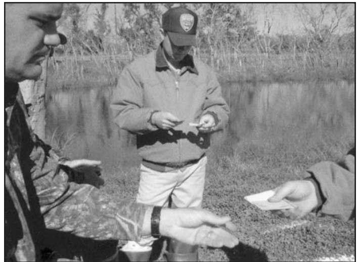
Cadets performing license checks during in-field scenarios.

There is a very apt statement, dead ducks lay no eggs. It makes no difference whether the duck died from disease, drought, predation, or was shot, it is still a dead duck, which can't contribute to future generations. The illegal kill of