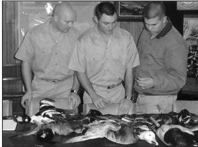
Cadets learning wing and duck identifications.

The course is broken down into several blocks of instruction. Violator Facts and Figures consists of what makes up a duck hunter, duck hunter philosophies, waterfowl hunter behavior, and waterfowl arrests by time of day. Puddle and Diving Duck Identification, is taught by hands-on wing