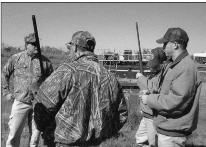
Cadets interviewing hunters during in-field scenarios.