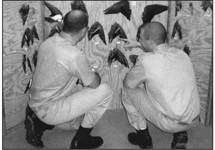
Wing board used during wing identification class.

opening days for ducks, coots, and geese. These are the migratory game birds that are mainly pursued by bird hunters in Louisiana. Other migratory game birds, which visit the state, are snipe, woodcock, rails, and gallinules. The state not only hosts an abundance of migratory game birds but it also hosts many other types of migratory non-game birds such as cranes, herons, ibis, killdeer, and grebes. These migratory non-game birds have no