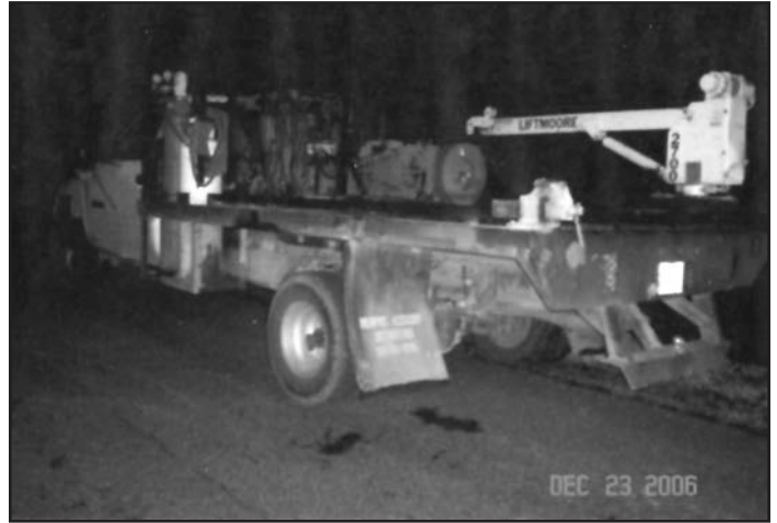
Seized vehicle from night hunting case.