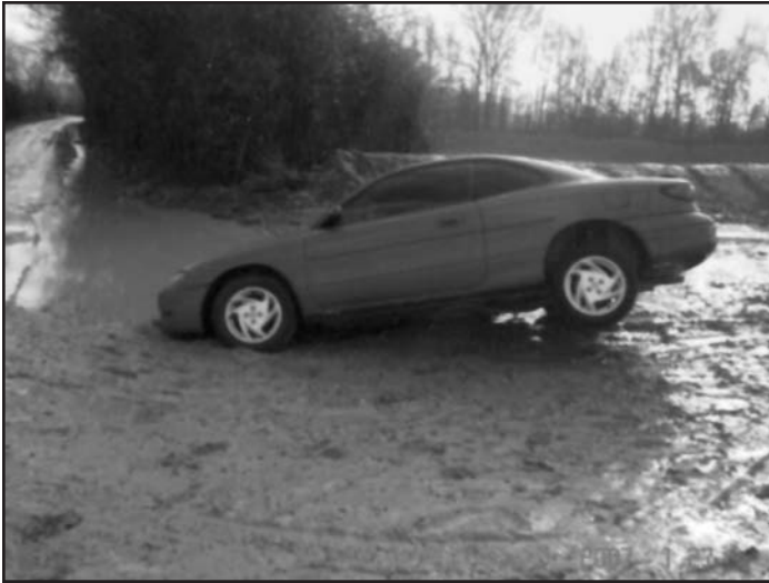
A stolen car recovered by St. Landry Wildlife Agents and the St. Landry Parish Sheriffs office, resulting in one subject being arrested.