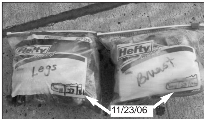
Turkey meat seized. Notice the date.

back outside and issued him a citation for taking Turkey closed season, seized the shotgun he said he had used and the two bags of meat that he had given us. We were unable to locate the photograph that was taken of this subject with his turkey but he wrote a nice detailed statement to what he had done. We left this residence not really believing how easy it was to make that case and wishing they would all be that easy.