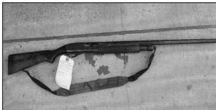
Shotgun used to take turkey.