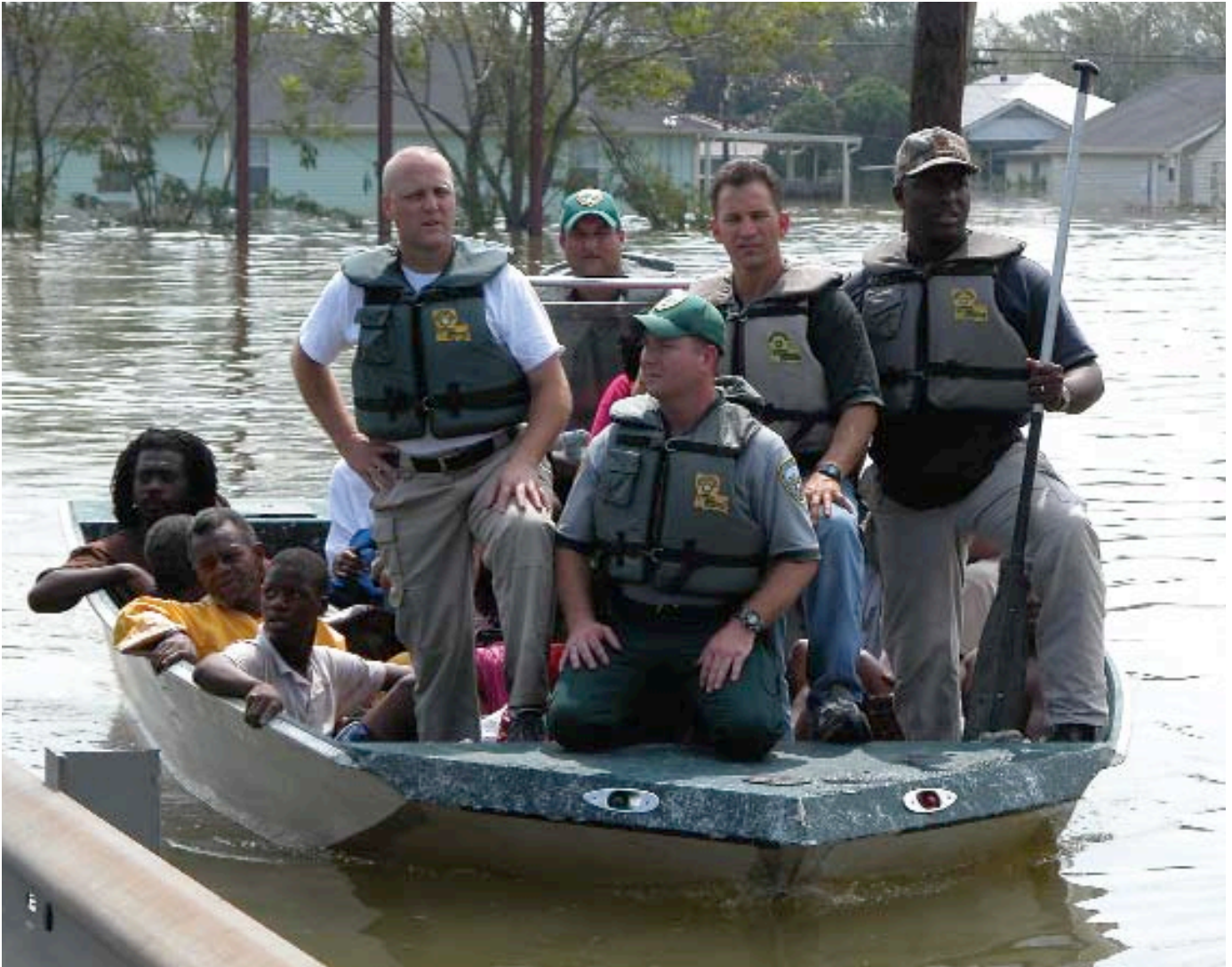
Lt. Governor Mitch Landrieu (standing at front of boat above) assisted LDWF agents with a number of rescue missions.